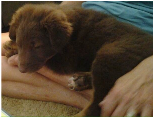
August 14, 2020, Thea Tsurumoto's red boy "Tanko" turned 8 years old.