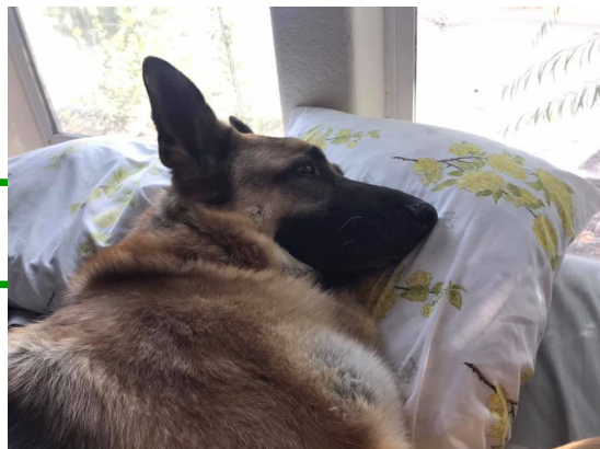
"Nap Attack" Sharon White