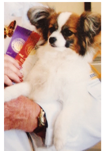
"Blossom" Gamblers Rambling Rose

Our deepest condolences go out to Carolyn Goepner. About 10 days ago she lost three senior dogs over a period of just a couple days. Chinese Crested "Star" ~ Mortfair Starlicious ~ was 16 years old (picture not available). Papillons "Blossom" was 14 years old & "Blanco" was 13 years old. It's tough enough to lose just one. I can't imagine losing three at the same time. We're so sorry!