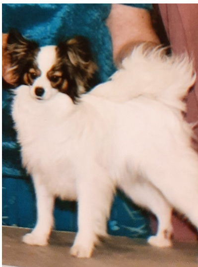
"Blanco" CH Gamblers Snow Bandit