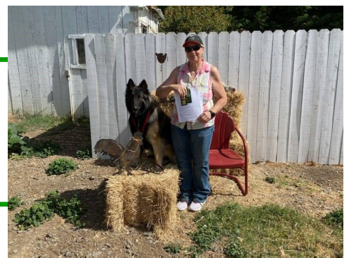
New title! Well done puppy!