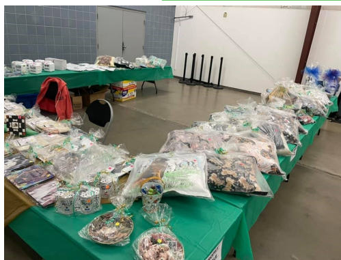
The Sunday BKC Trophy Table ~ our trophies were a big hit with our exhibitors this year!