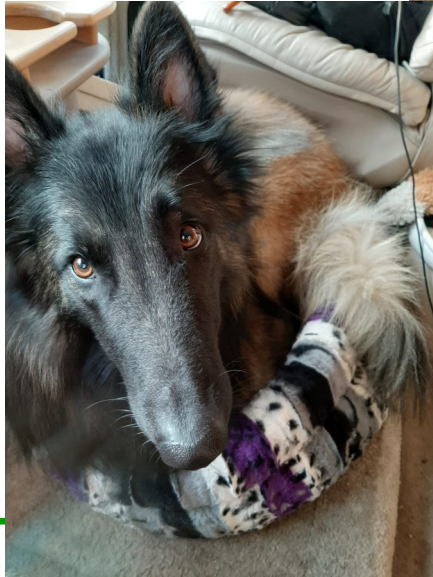
When ya just can't come to grips that you have grown too big for the bed you had when you were a baby puppy!