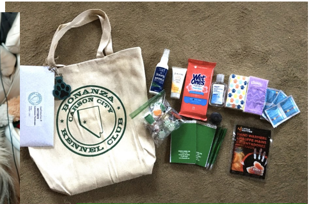
Gift bags for our judges were waiting at the front desk of their hotel as they checked in. The bags had a paw print key fob [clipped to the handle], hand sanitizer, wet wipes, hand warmers, Kleenex, lip balm, wrinkle release, writing tablets, pens, hand lotion, & a bag of mixed candies. The judges enjoyed all the goodies that were in our bags.