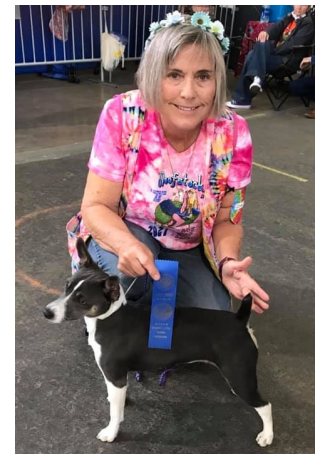
11/07 Rosethorn @ Battle Born Paintin The Town Blu won her class over another really nice puppy! She did really well on the table again! Looking forward to great things with this beautiful little girl!