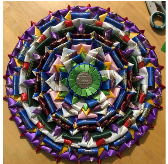
Elaine Oxborrow had this amazing rosette made for "Ripley"