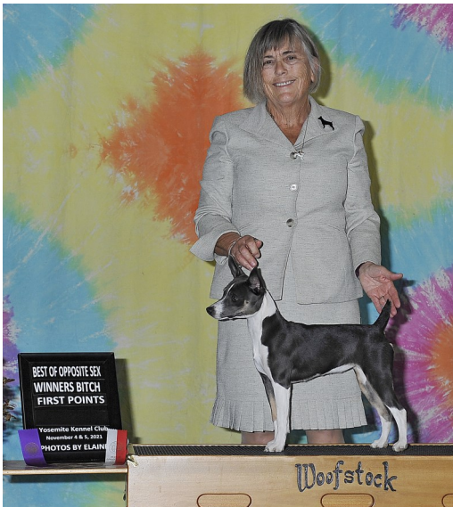
Days after her 6-month birthday, Rosethorn @ Battle Born Paintin The Town Blu, walked into the show ring for the first time! She won her class over another puppy, then won Winner's Bitch over 2 others.