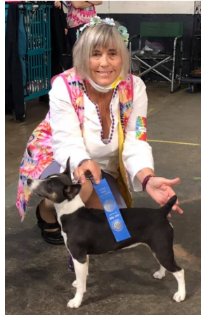
11/06 Rosethorn @ Battle Born Paintin' The Town Blu won her class today! She did well on the table but was a bit freaked out by the noise and the big Bull Terriers!