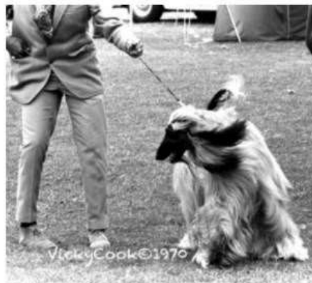
left: Ch. Summerwind Sacre Blue Mist; right: the famous Afghan Hound Ch. Coastwind Gazebo, 'Ezra'