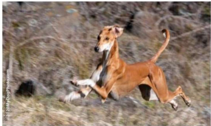
Ch. SX3 Wings (Amelia)

of the first Desert Storm. So, what we see is a breed that is, genetically, in good shape, and that exceptions that are “generic show dogs” are unusual—what, in Botany, they would refer to as a “sport.”