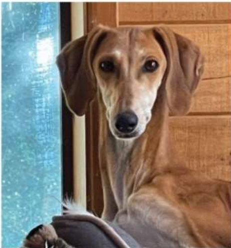
Ch. SX4 Santana Wings