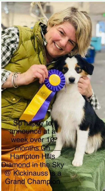
So happy to announce at a week over 10 months Ch Hampton Hills Diamond in the Sky @ Kickinauss is a Grand Champion