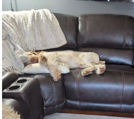
Elaine Bergenheier's Spinone "Ryker" knows how to chill!