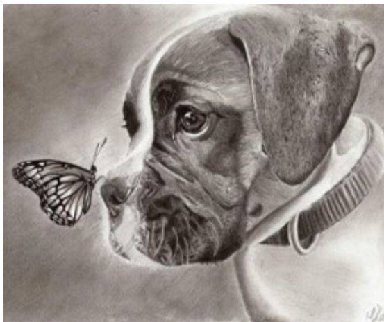
Dog and Butterfly by TeSzu