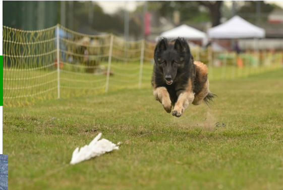
"Maverick" loves chasing the rabbit!