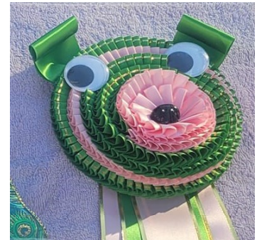
Take a close look at the BIS rosette!