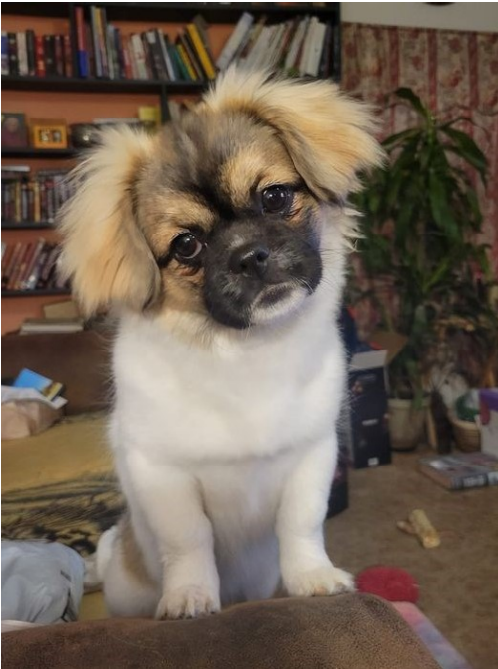
02/04/2023 "Cricket" after a bath