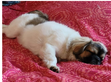
One pooped puppy!