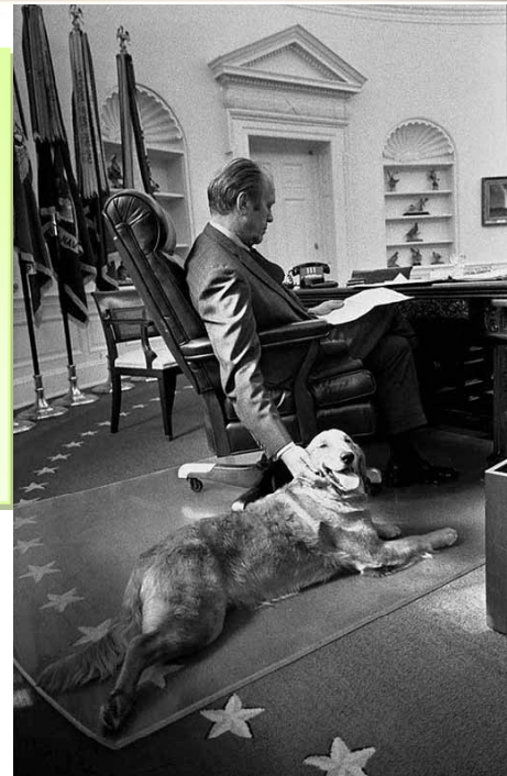
Gerald Ford & “Liberty”

“All of us know for a fact that dogs are man’s best friend. With their finely-tuned instincts, they seem to know their owner’s mood and feelings immediately. They know when to comfort us when we’re sad, and they know when’s the right time to have fun. However, do we know and completely understand our dogs the same way they do us? Are we even aware of the meaning behind their strange behaviors?” READ MORE