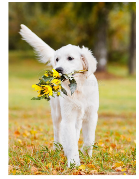
BKC April 2023 ~ Page 5

<u>CLICK HERE</u> for more information on the Certified Ring Steward Program and to visit the Dog Show Ring Stewards page on the AKC website.