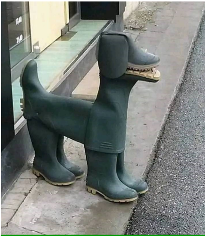
Something to do with your old boots!

Respectfully submitted by Lexine Thompson