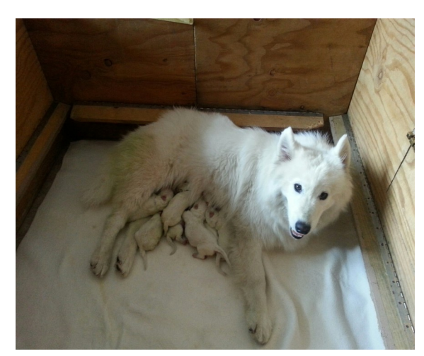
THE MILK WAGON IS IN!!