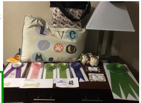
Archie's Friday treasures!