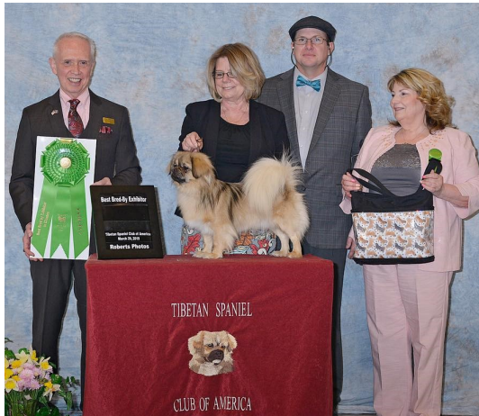
"Archie" - Best BBE, Tibetan Spaniel Club of America National Specialty 03/29/19