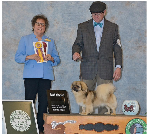
"Archie" - Best of Breed / Best Owner Handler Chintimini Kennel Club 03/30/19