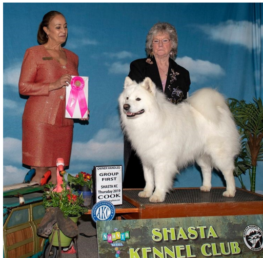
"Future" - Owner Handler Group 1 Shasta Kennel Club