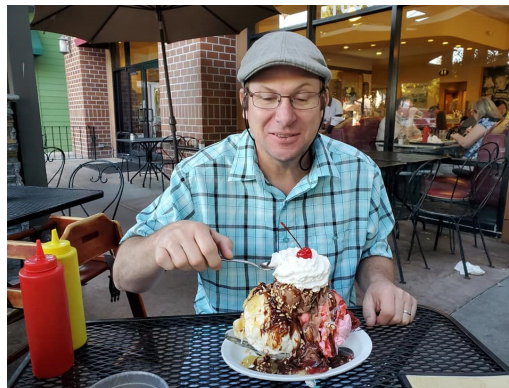
When you win Breed, you eat well!