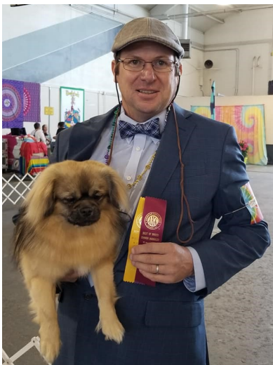
Woofstock Friday 6/7