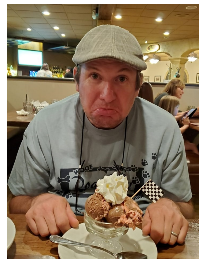
When you're "only" Select your dessert isn't as big ...