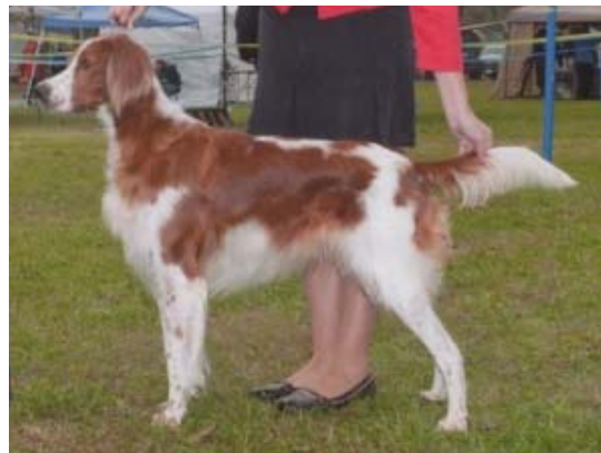
Irish Red and White Setter